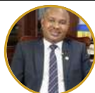
Jabu Ntsokolo Ishmael Mbalula MEC Community Safety, Roads & Transport